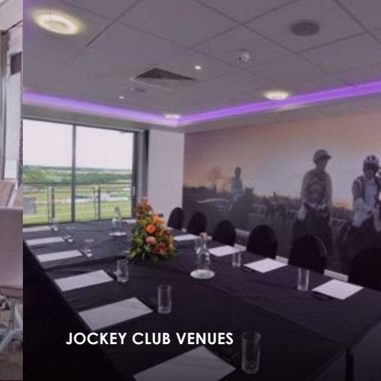
JOCKEY CLUB VENUES