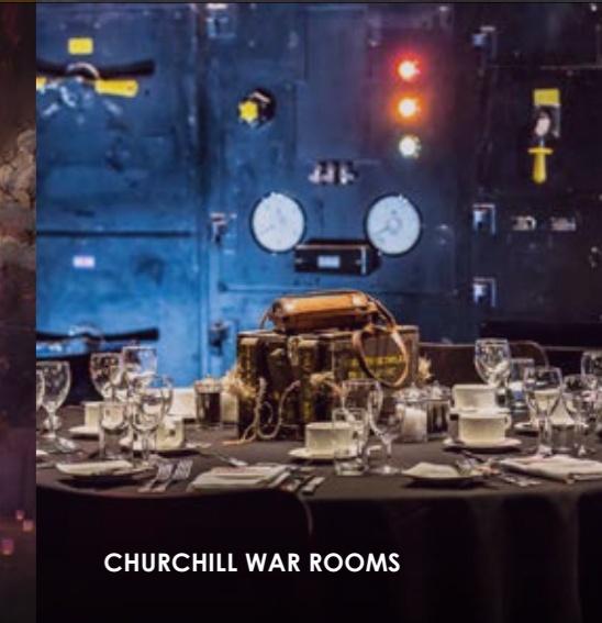
CHURCHILL WAR ROOMS