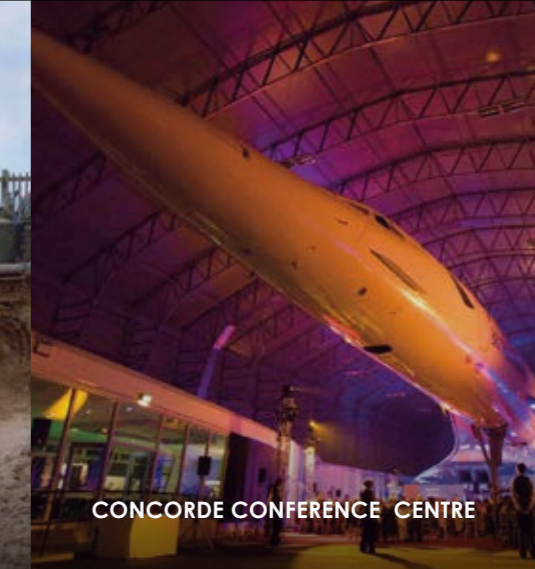
CONCORDE CONFERENCE CENTRE