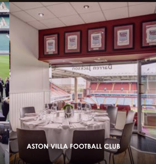
ASTON VILLA FOOTBALL CLUB